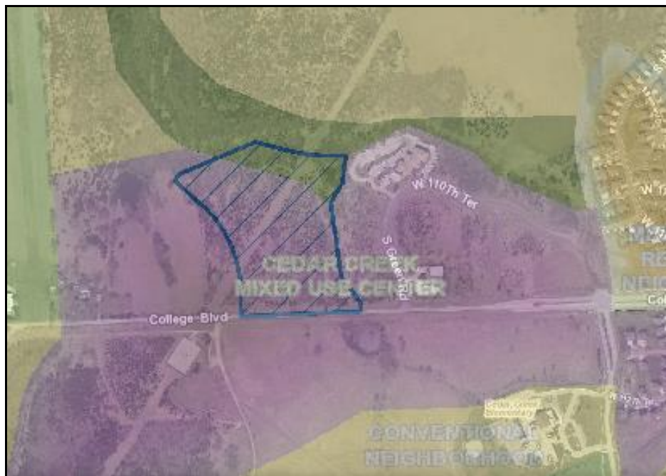
Image 1: Location of subject property (outlined in navy) on the Comprehensive Plan Map

The Comprehensive Plan (PlanOlathe) designates the subject property and nearby area as Cedar Creek Mixed Use Center (see Image 1 below). The Cedar Creek Mixed Use Center consists of a mixture of uses including attached residential, institutional, commercial, and mixed-use (residential over retail). Development options within the Cedar Creek Mixed Use Centers include town centers, suburban centers, office campuses or flex-space mixed use.