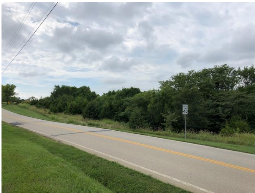
View of subject property from College Boulevard, looking northwest