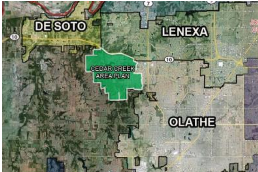
Image 2: Location of Cedar Creek Area Plan

The subject property is also located within the Cedar Creek Area Plan, as can be seen in Image 2, below. The Cedar Creek Area Plan encompasses approximately 4,200 acres of land in the northwestern portion of the City, south of K-10, west of K-7 and generally north of 119 th Street.