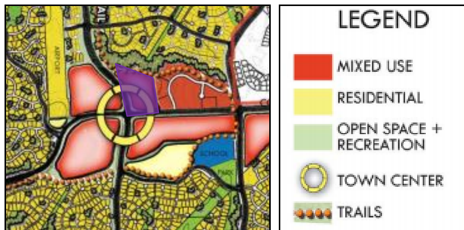
Image 4 (above, left): Cedar Creek Area Plan Map at intersection of College Boulevard and Cedar Creek Parkway with the general location of the subject property identified in purple

The Cedar Creek Area Plan Map further identifies two locations as Town Centers; the northern Town Center is at the intersection of Valley Parkway and Cedar Creek Parkway, and the southern Town Center is at the intersection of College Boulevard and the future Cedar Creek Parkway (the subject property, see Images 4 and 5 below).