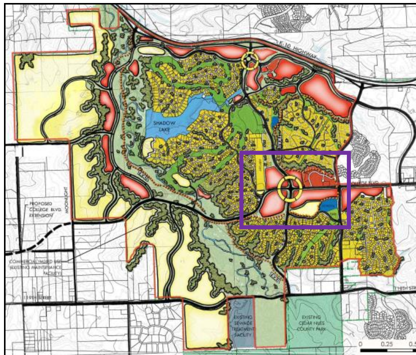
Image 3: Cedar Creek Area Plan Map – Inset Map provided on page 6 (Image 4) for area outlined in purple

The Cedar Creek Area Plan Map (Image 2, provided below) designates properties as either Mixed Use, Residential, Open Space + Recreational, Trails, and/or Town Center.