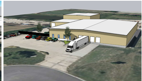
3 Renderings SCALE: nts