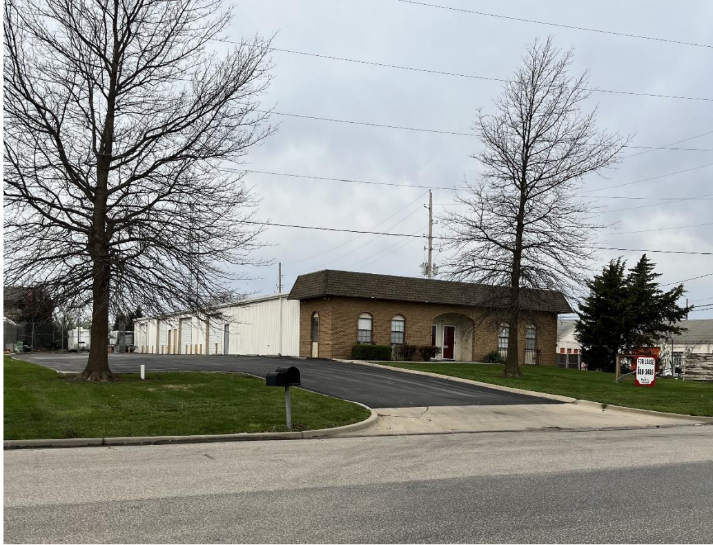
View of subject property looking southwest.