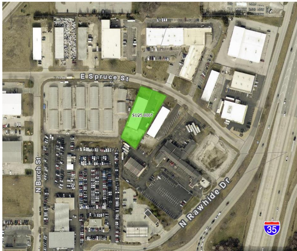
Aerial view of the subject property highlighted in green.

The site is currently developed and consists of a 6,250 square foot building and parking lot. Existing landscaping is located along the building foundations, rear east and south property lines consisting of shrubs, and evergreen and deciduous trees.