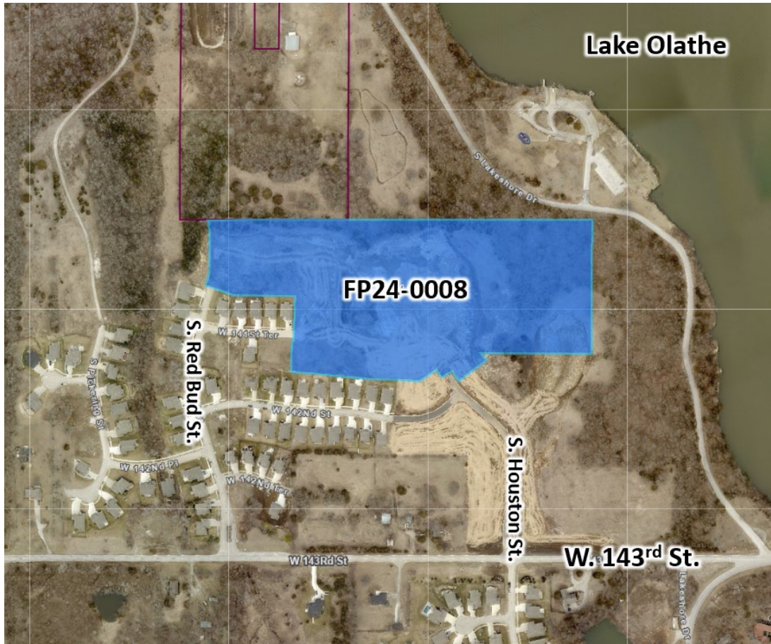
Aerial view of subject property outlined in blue.