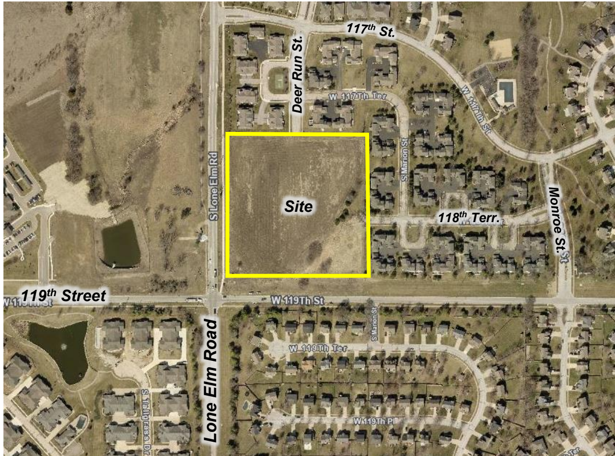
Aerial map with subject property outlined in yellow.

The 119 th Street Extension project is currently underway, with completion of the four-lane bridge over the BNSF railroad expected in 2027. Once complete, 119 th Street will connect K-7 Highway to Interstate 35 and traffic is expected to increase significantly along this new major east/west corridor through Olathe. Corresponding improvements are being made along 119 th Street, including turn lanes and traffic signals at 119 th Street and Lone Elm Road. Traffic projections for 119 th Street indicate an increase in volume of 142% west of Woodland Road by the year 2045, which would be equivalent to the amount of traffic currently handled by 151 st Street at Black Bob Road today.