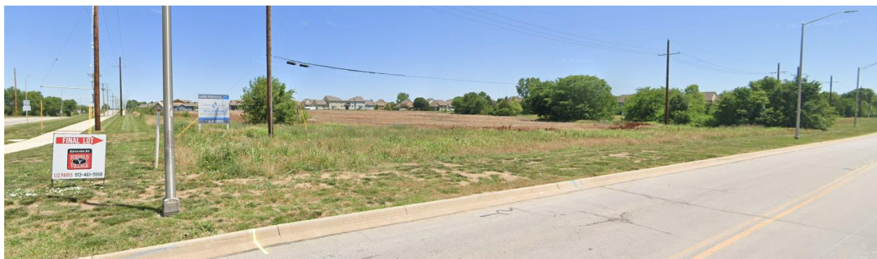
View of subject property looking northeast from 119 th Street and Lone Elm Road.