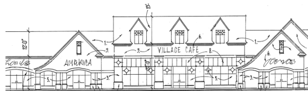
Approved building for Foxfield Village N.C.

The subject property was annexed into the City of Olathe in 1998 (Ord. 98-121). At the time, the property was used for agricultural purposes and retained its County RUR zoning. In 2005, City Council approved a request to rezone (RZ-05-010) the site from Country RUR to the NC District for the Foxfield Village Neighborhood Center development. This mixed-use development included a preliminary site development plan for seven (7) buildings with a total of 59,700 sq. ft. of commercial space and 19 dwelling units on the 2 nd floor of the largest commercial building.