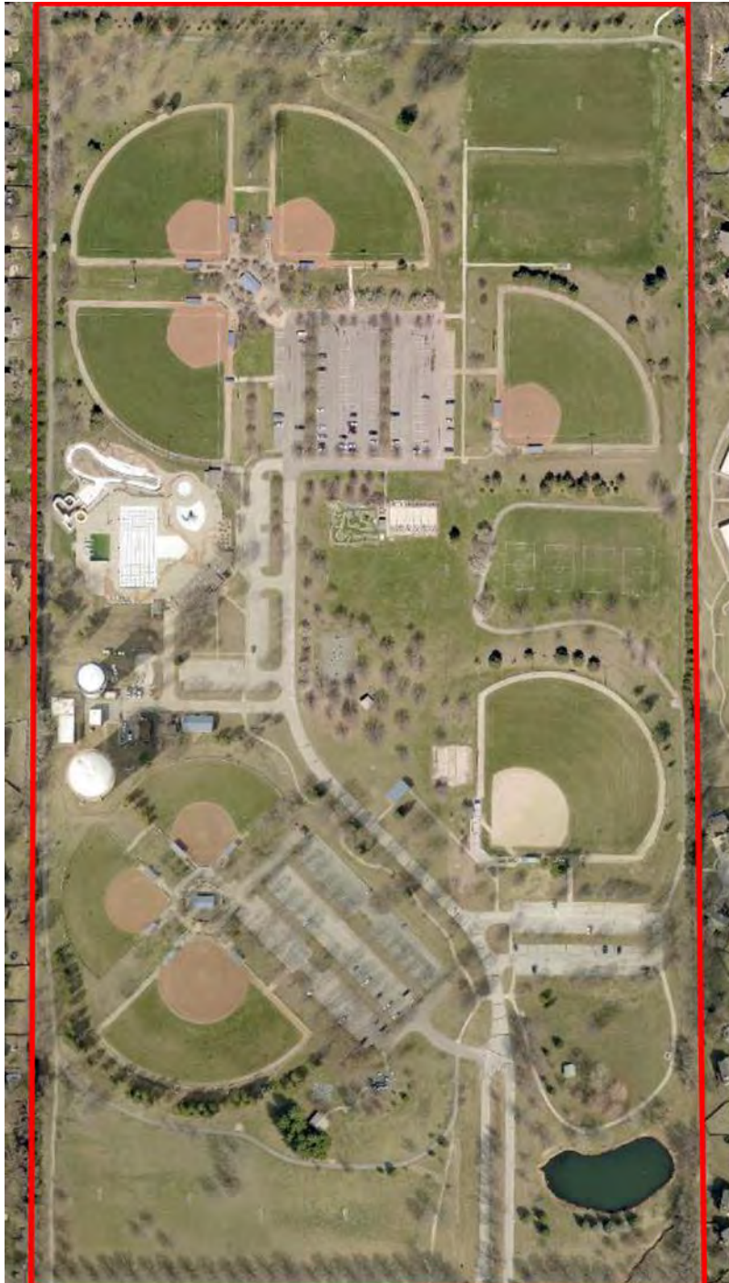
Figure 1: Map of Black Bob Park - 14500 W. 151st Street

This park improvements project will include constructing a new parking lot adjacent to the pool at Black Bob Bay, adding a loop back to the main access road from the new parking lot, replacing the existing play equipment and play surface. Included also is the replacement of an existing picnic shelter and adding a new restroom near the playground and relocating an existing batting practice area.