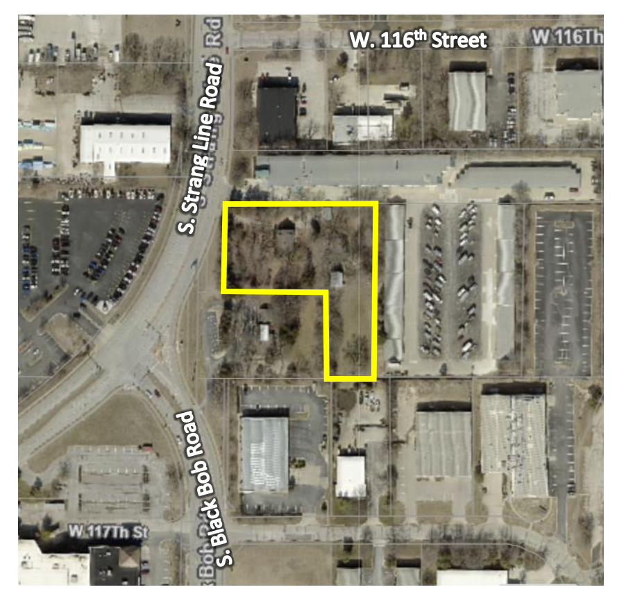
Aerial view of subject property outlined in yellow.