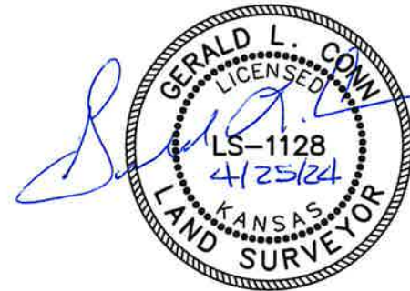
EXHIBIT "A" UTILITY EASEMENT VACATION

I hereby certify that this exhibit has been prepared by me or under my direct supervision. The information and distances shown herein are correct to the best of my knowledge. If the surveyor's signature is not an original in blue ink this document is a copy. The professional certification contained on this document shall not apply to copies or unauthorized alterations.