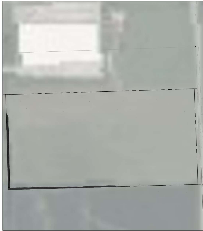
1 EXISTING WOODLAND 1" = 200'