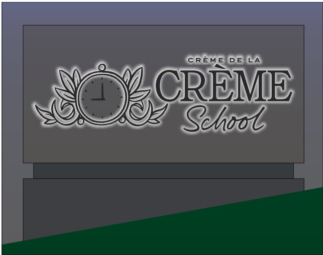
3 Night View Scale: 1/2" = 1'-0"