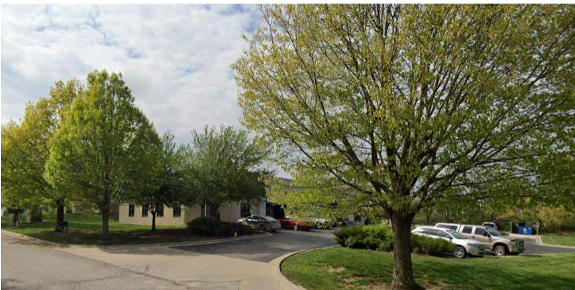
View of the subject property looking northwest.