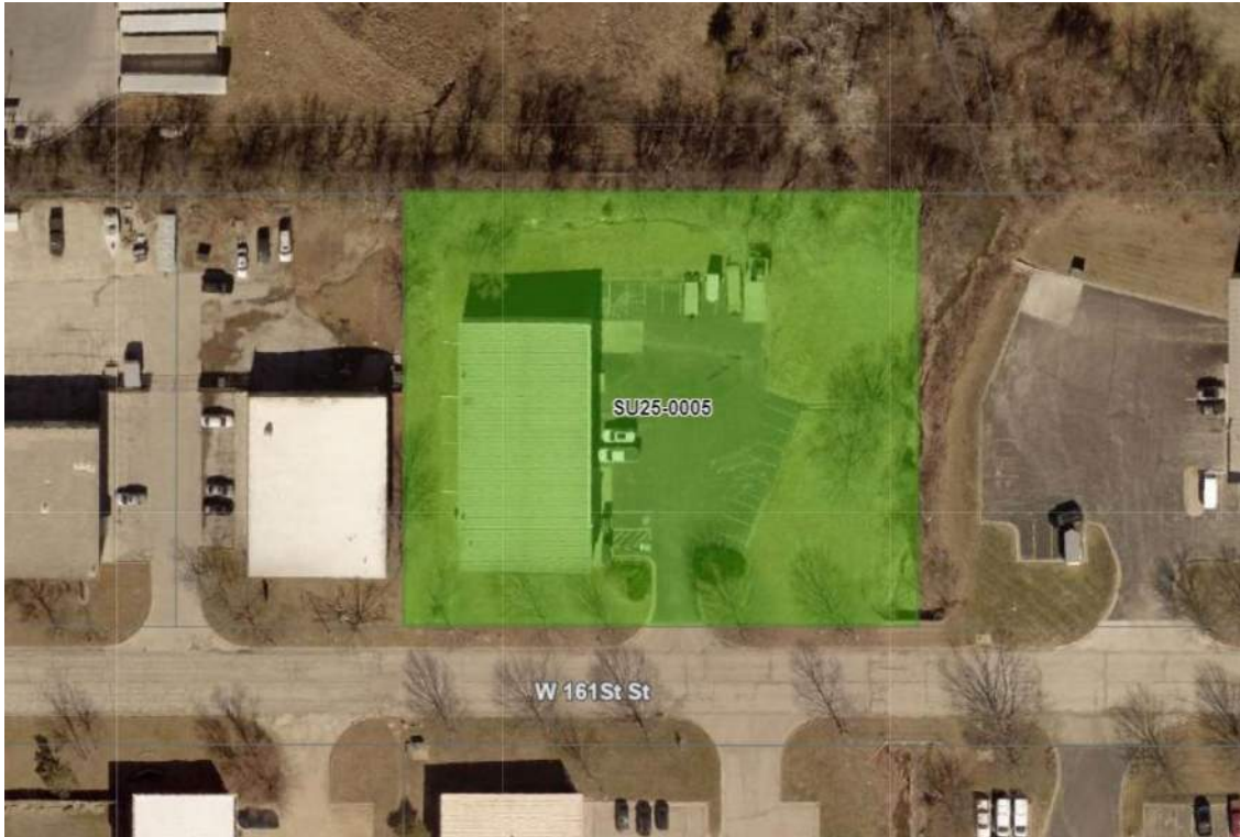
Aerial view of the subject property shaded green.

The subject property was zoned to the M-2 (General Industrial) District and platted in 1988 as a part of the South Olathe Business Park. The existing building and parking lot were later constructed in 1996 and have remained as they are today. No changes to the building or lighting are proposed with this application.