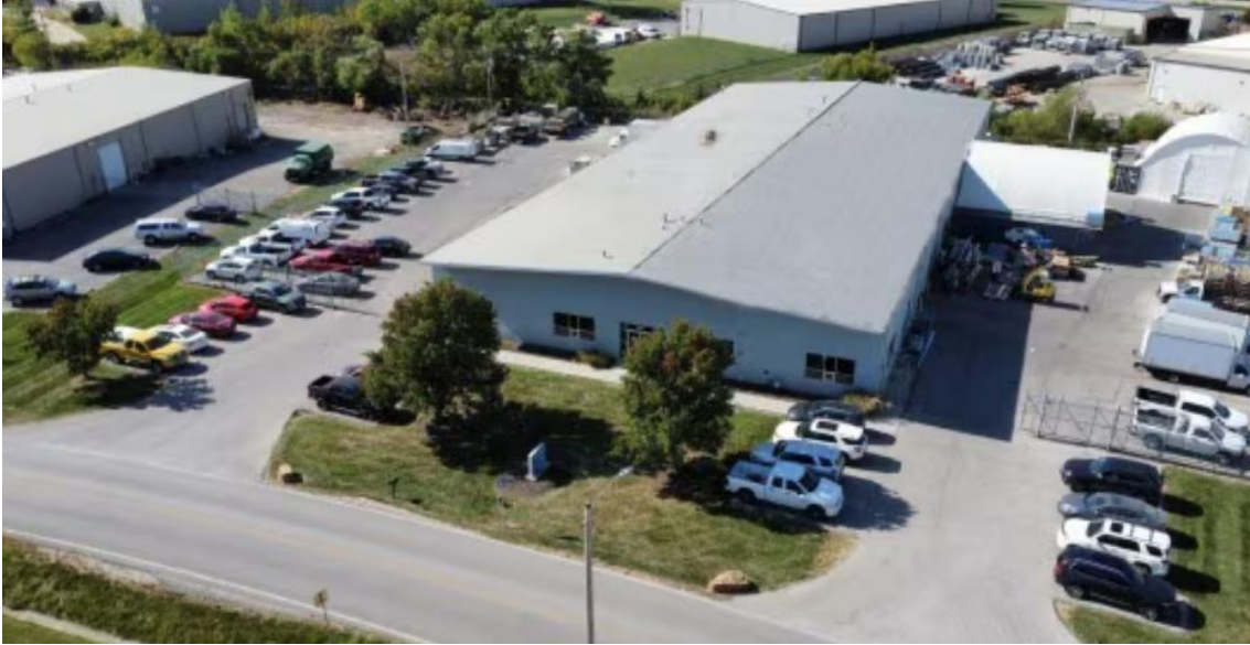
View of subject property looking west from S. Keeler St.