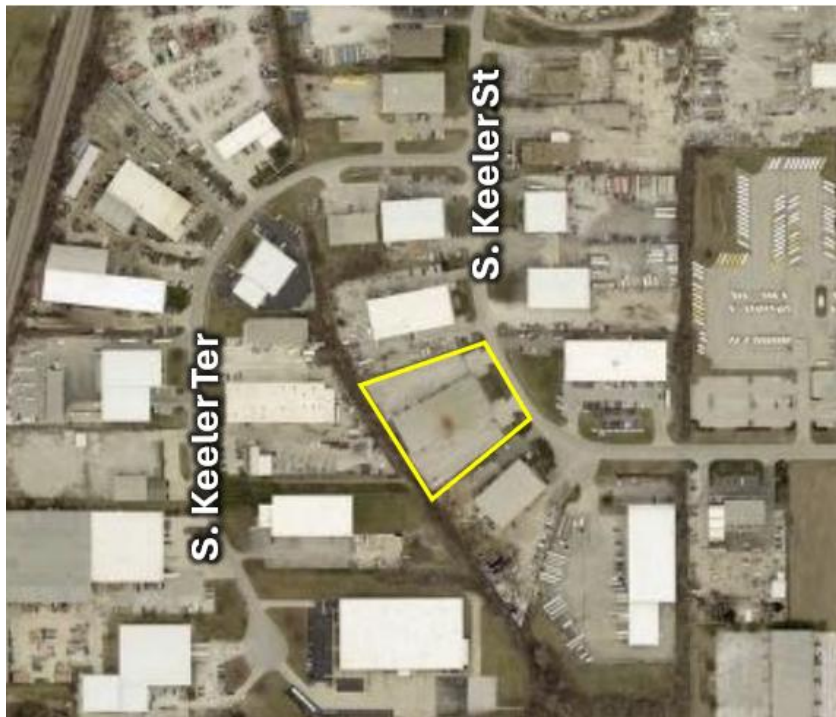
Subject property outlined in yellow.