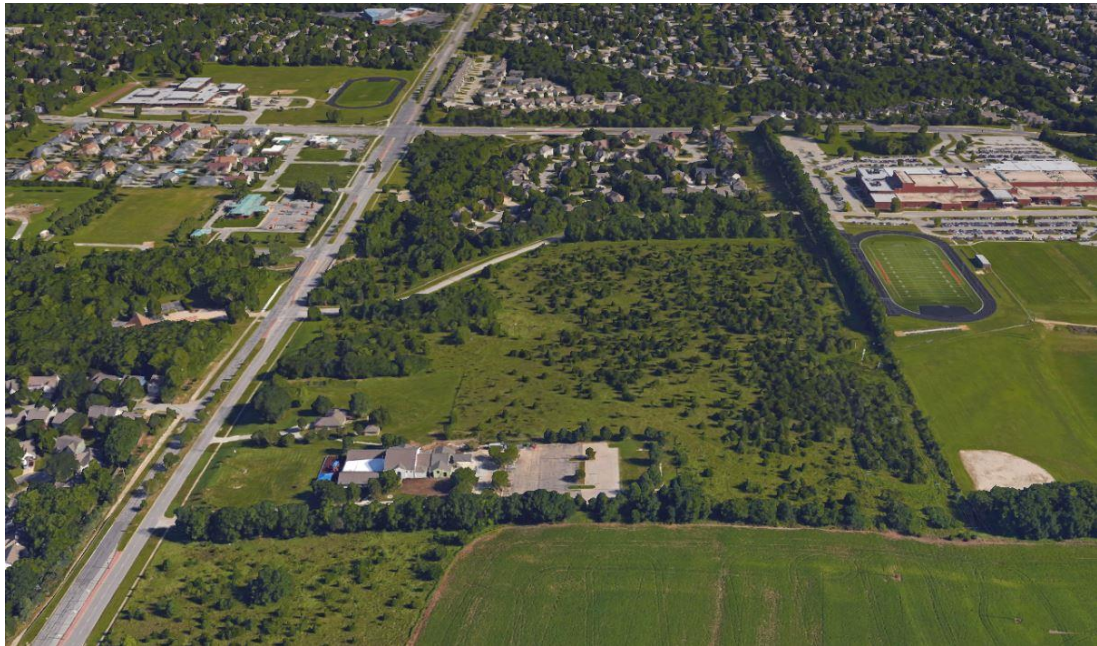
Aerial view of the property, looking north