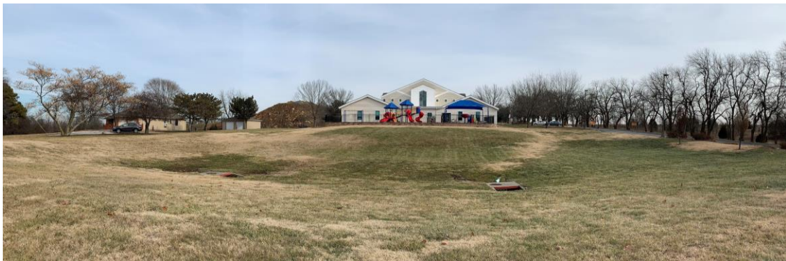
View from Black Bob Road, looking east