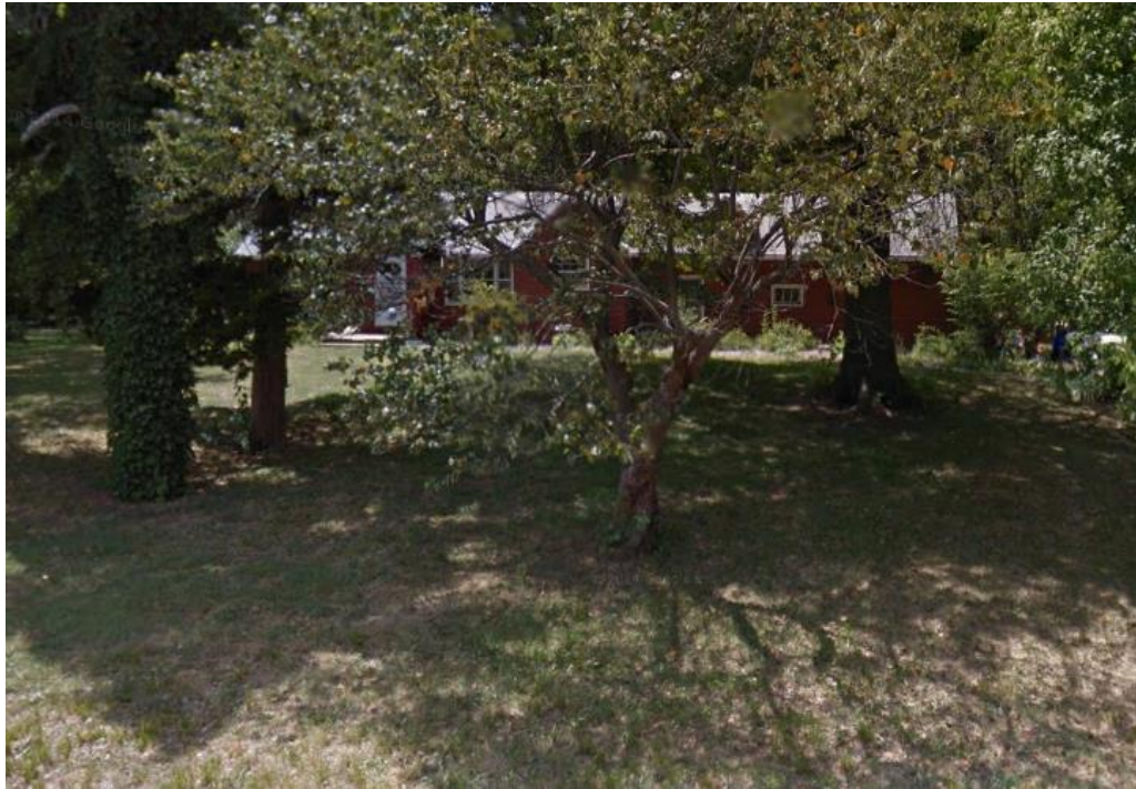
View of home from Parker Street prior to remodeling

Staff recommends approval of FP19-0003, final plat for Hickman Farms Estate with the following stipulations: