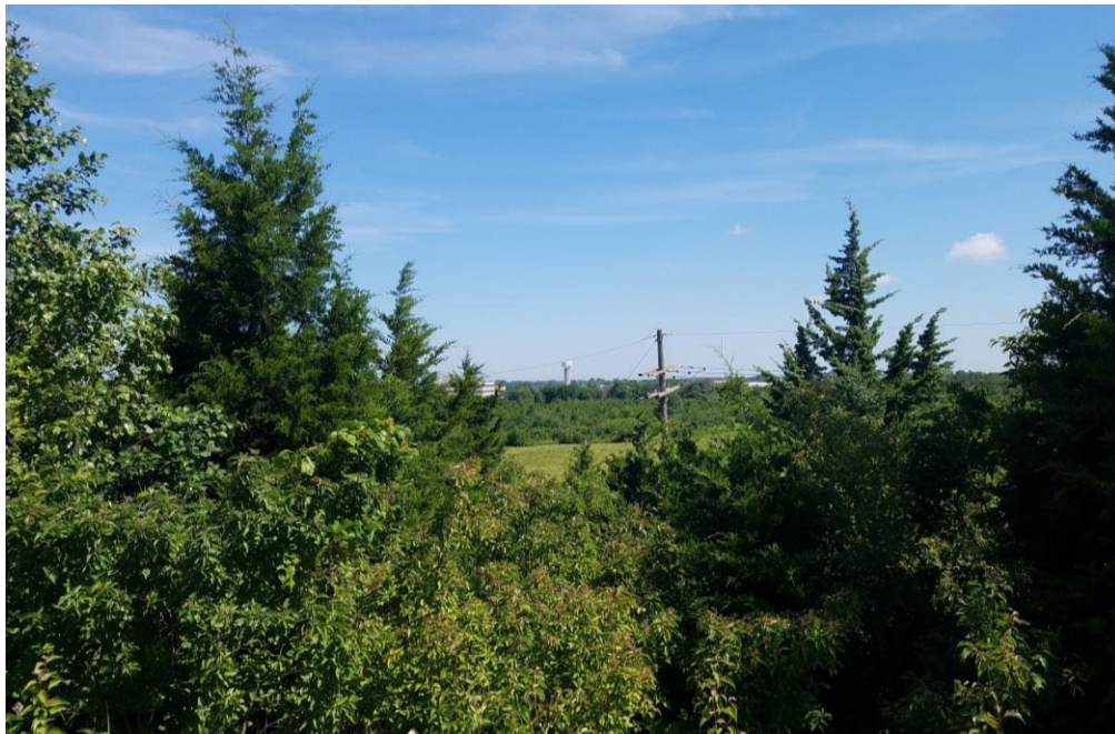
(View from Kansas City Road, looking west to site)