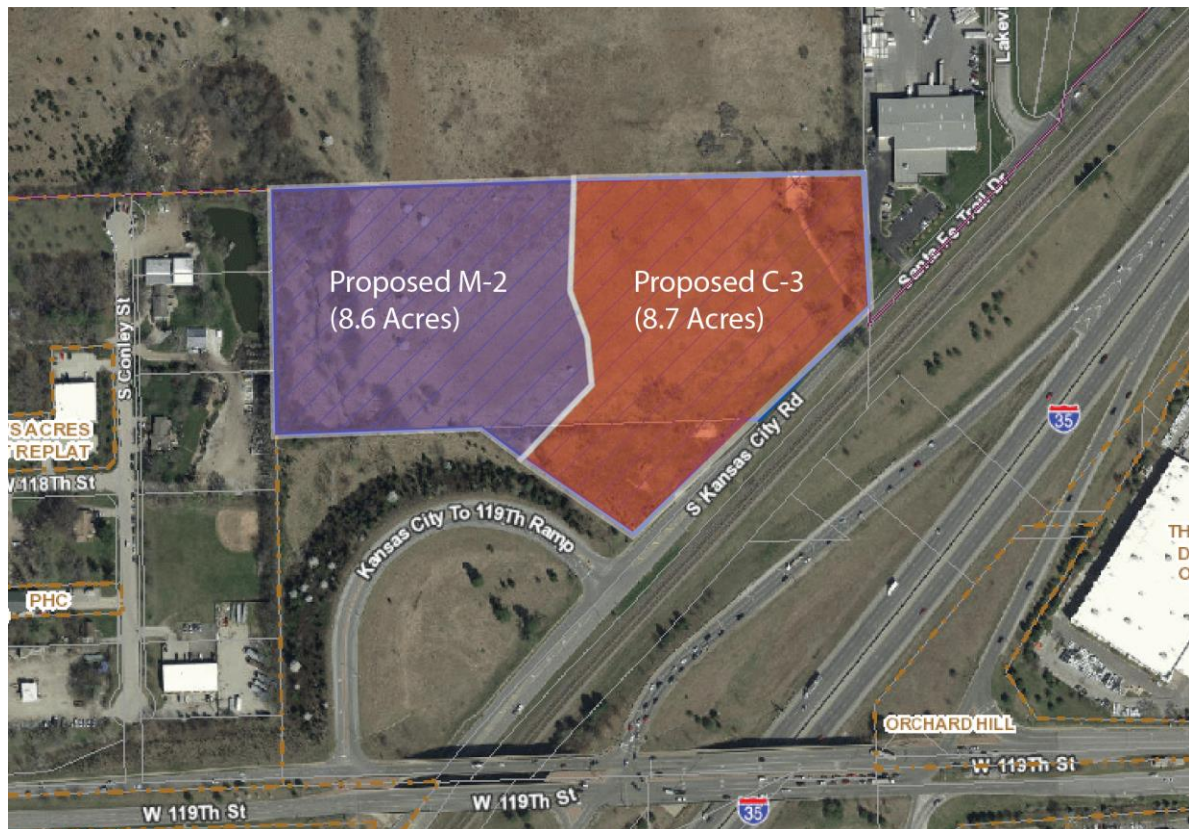
(Site location map)

The applicant is requesting a rezoning from County PEC-3 and M-2 district to C-3 (Regional Commercial) district on 8.73 acres and M-2 (Heavy Industrial) district on 8.62 acres. The subject property is located in the vicinity of 119 th Street and Kansas City Road on the north side of the 119 th Street ramp.