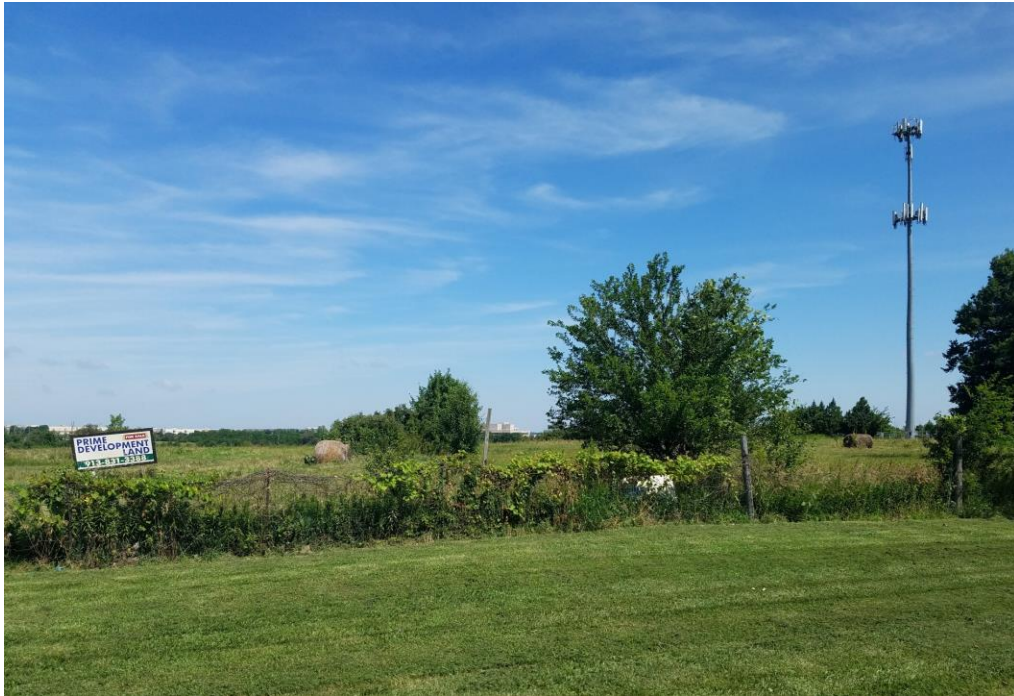
(View from Kansas City Road, looking west to site)

Much of the site is undeveloped with the exception of an existing telecommunications facility and old storage shed on the northeast corner of the site. There are existing trees along the south, east and west property lines.