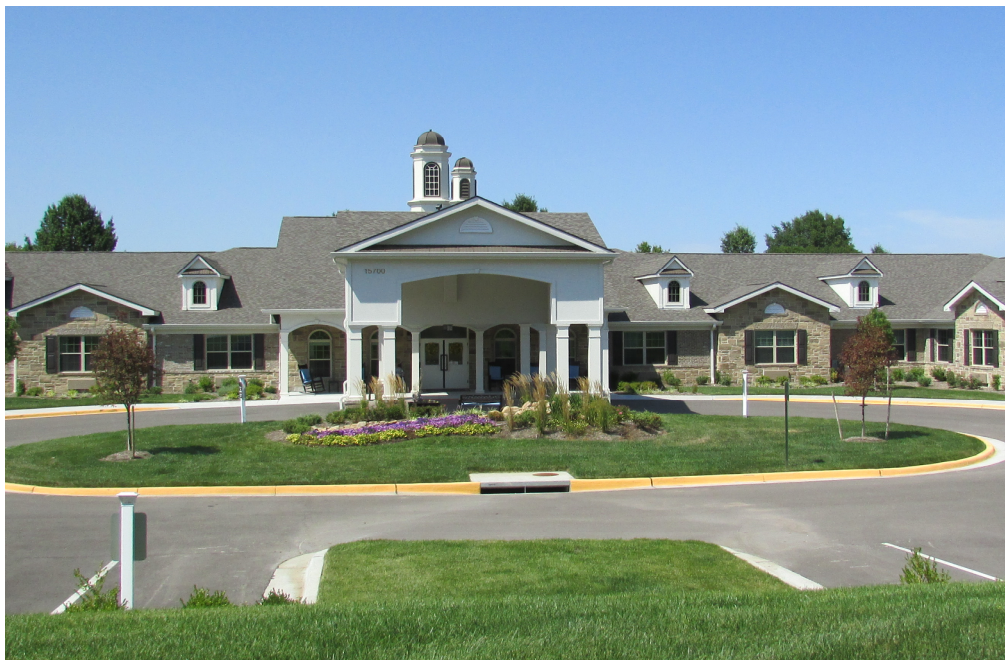
View of front of Benton House from 151 st St.

Staff recommends approval of the sanitary easement vacation as proposed.