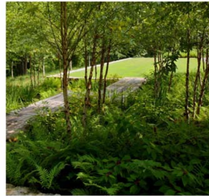
SEDGE MEADOW / RAIN GARDEN