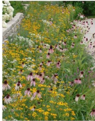
SHORTGRASS PRAIRIE SPRING/SUMMER