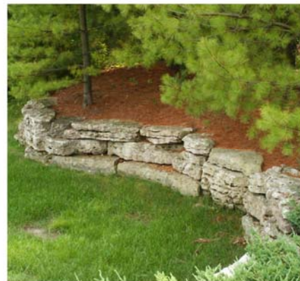
SEDGE MEADOW / RAIN GARDEN