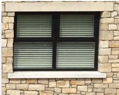
DARK ALUMINUM FRAMES CAST STONE WINDOW SILLS