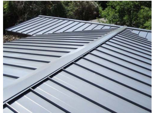
STANDING SEAM METAL ROOF