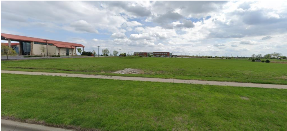
View of the subject property, looking south from W. 151 st Street