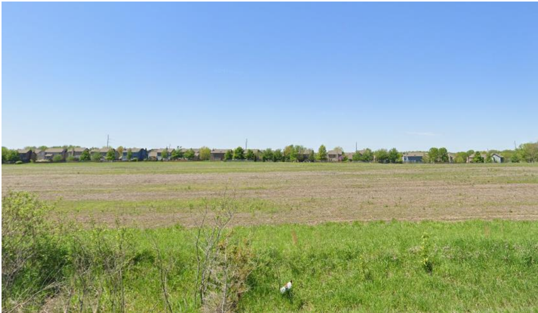
View of site looking west from Pflumm Road.

The subject property is currently vacant and has never been developed. The only vegetation that exists on the subject property is native grass and a narrow line of trees along the east side of the property within the Pflumm Road right-of-way. There are also significant gas easements approximately 133 feet in width that extend north to south within the western portion of the property.