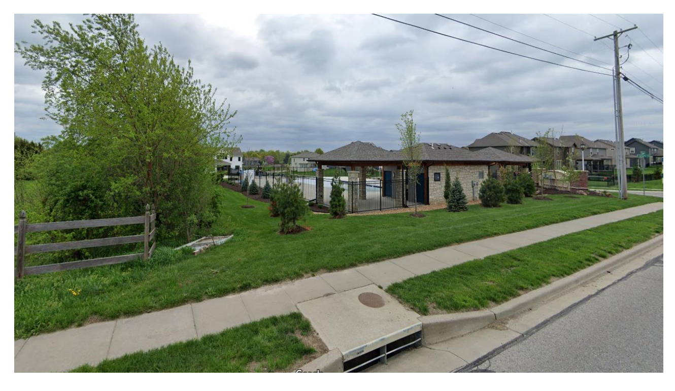
View of existing tree line and pool facility, looking southeast from N. Iowa Street.