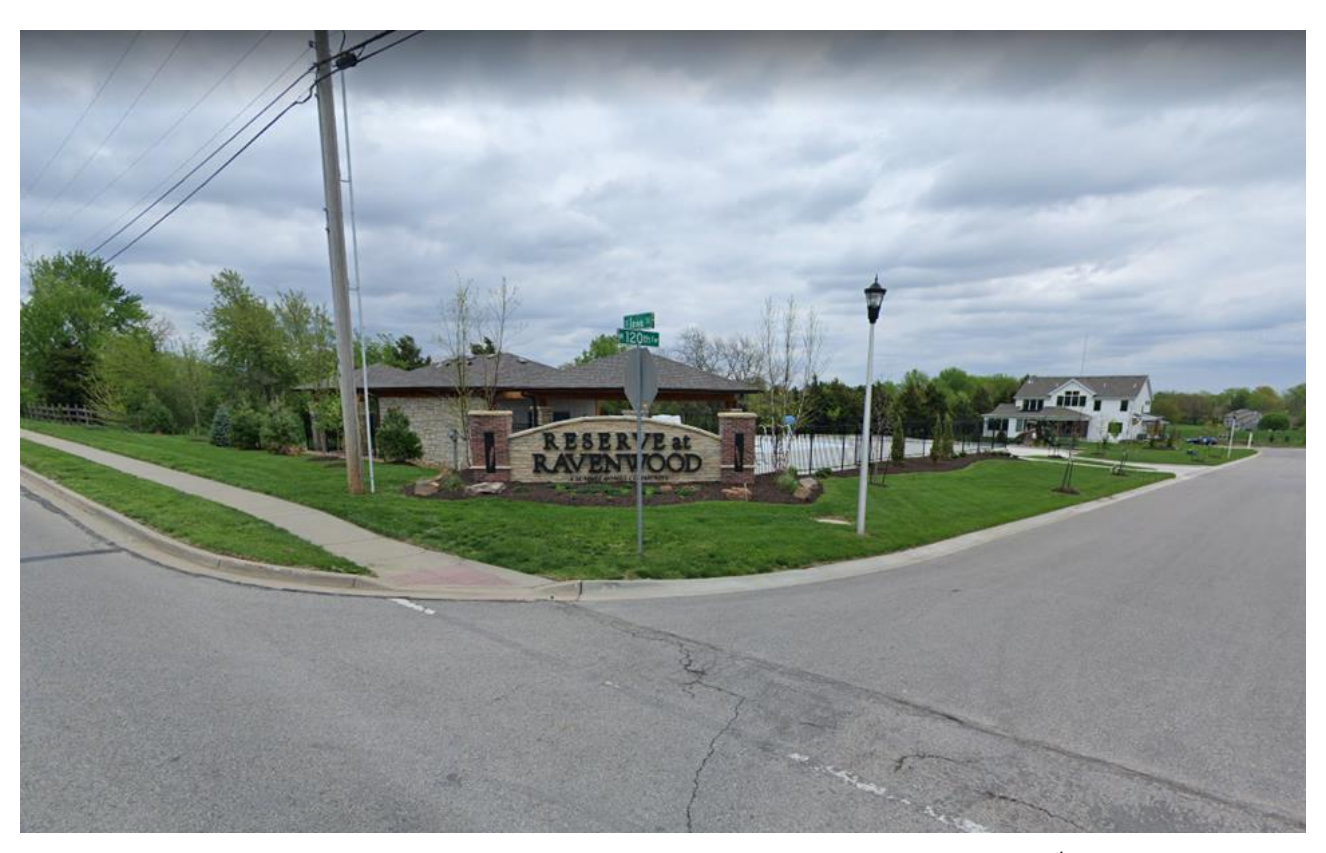
View of site looking northeast from intersection of N. Iowa Street and 120<sup>th</sup> Terrace.