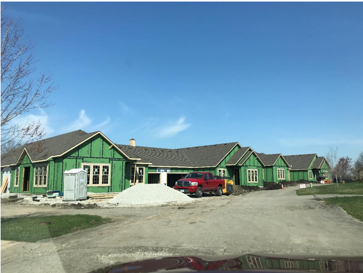
View from South Church Street