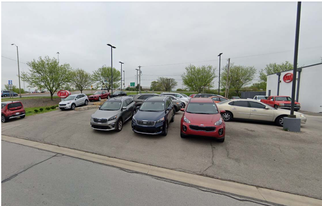
View of property looking east from N. Fir Street.