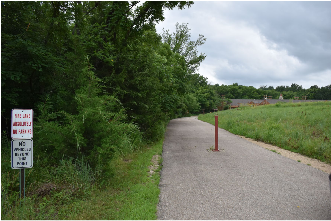
Proposed area for utility vacation segment, adjacent to existing access drive.

A new notice of hearing was published for this meeting on Wednesday, April 22, 2020. All other public notice requirements per the UDO have previously been met.