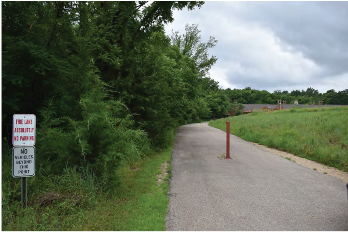
Proposed area for utility vacation segment, adjacent to existing access drive.

A new notice of hearing was published for this meeting on Wednesday, April 22, 2020. All other public notice requirements per the UDO have previously been met.