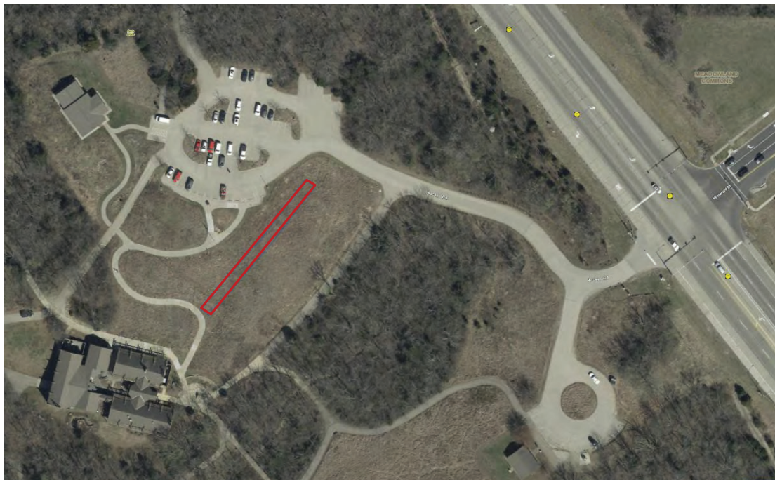
Site map with proposed easement to be vacated.

The applicant is requesting to vacate a portion of an existing, 15-foot-wide waterline easement at Ernie Miller Park and Nature Center located at 909 N. K-7 Highway due to relocation of a fire hydrant. The existing fire hydrant is being relocated to accommodate future ADA parking and improvements. This case is returning to the Planning Commission for vote due to an error in the recording of the motion at the original hearing on April 13, 2020.