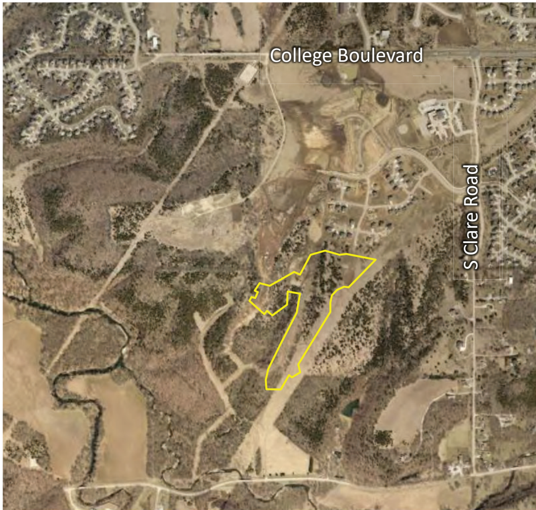
Aerial View of the Subject Property