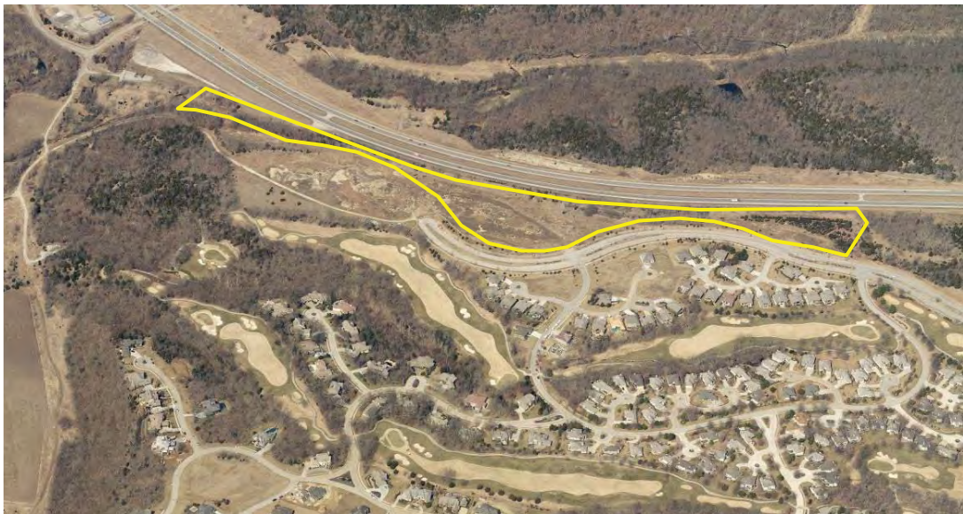
Aerial View of Subject Property