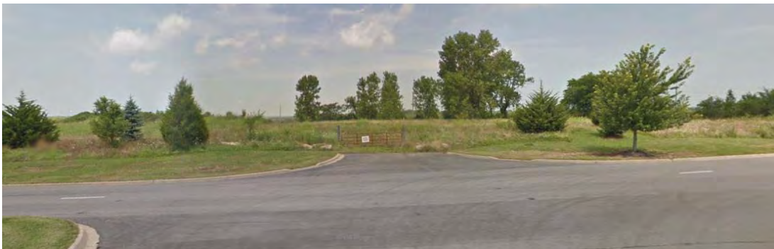
View of Property Looking North from Valley Parkway

The property contains native grasses and dense trees within the eastern portion of the property. Deciduous and evergreen trees have been planted adjacent to Valley Parkway throughout the length of the property. Overhead utility lines are located just north of the property within the right-of-way for K-10 Highway. The property slopes downwards towards the highway with the greatest variation in topography occurring in the center of the subject property and the easternmost portion.